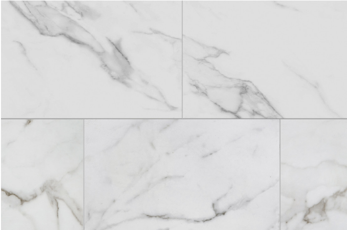
CARRARA MARBLE ESPCT68352C