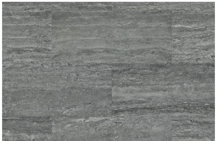
VOLCANIC ASH ESPCT68305C