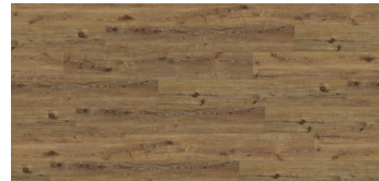
FARMHOUSE OAK ESPC68358C