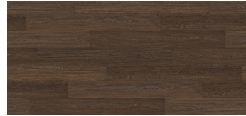
COCO BEACH ESPC68323C