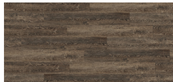
PEPPERCORN OAK ESPC68305C