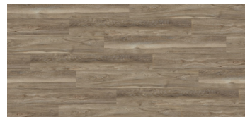
SALEM HICKORY ESPC68362C