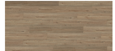
GINGER OAK ESPC68395C