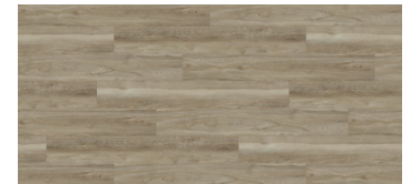
WASHED HICKORY ESPC68366C