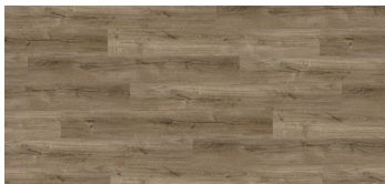
GEORGIA OAK ESPC68380C