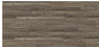
SOUTHERN PECAN ESPC68363C