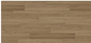
GOLDEN OAK ESPC68338C