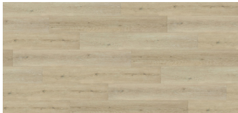
DESTIN OAK ESPC68381C