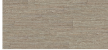
CAPE COD ESPC68332C