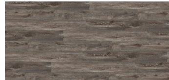
HOMESTEAD OAK ESPC68301C