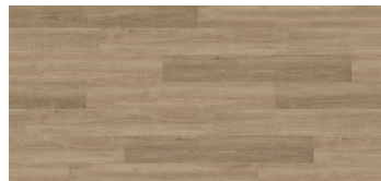
SEDONA OAK ESPC68371C