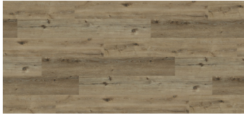
BEACHSIDE OAK ESPC68304C