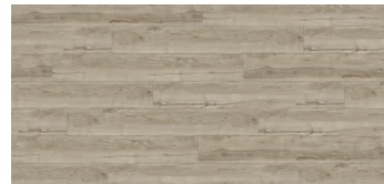
SPALTED BEACH ESPC68385C