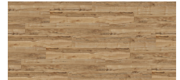
LODGE MAPLE ESPC68313C